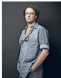
/ PAOLO PELLEGRIN