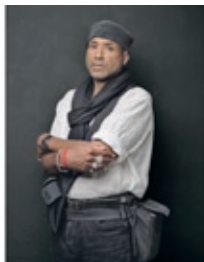
/ STANLEY GREENE