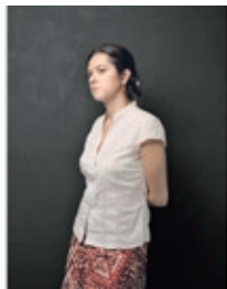
/ RENA EFFENDI